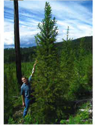
8 years growth