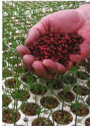
Seeds and Seedlings

Planters often use a "hoedad" to plant seedlings.