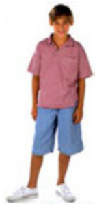
ABOUT 60% WATER