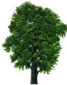
MORE THAN 50% WATER

In fact, water makes up a large percentage of all living things — and the Earth also! Water covers more than two-thirds of the Earth. About 60 percent of the human body is water. And more than 50 percent of a tree is made up of — you guessed it — water!