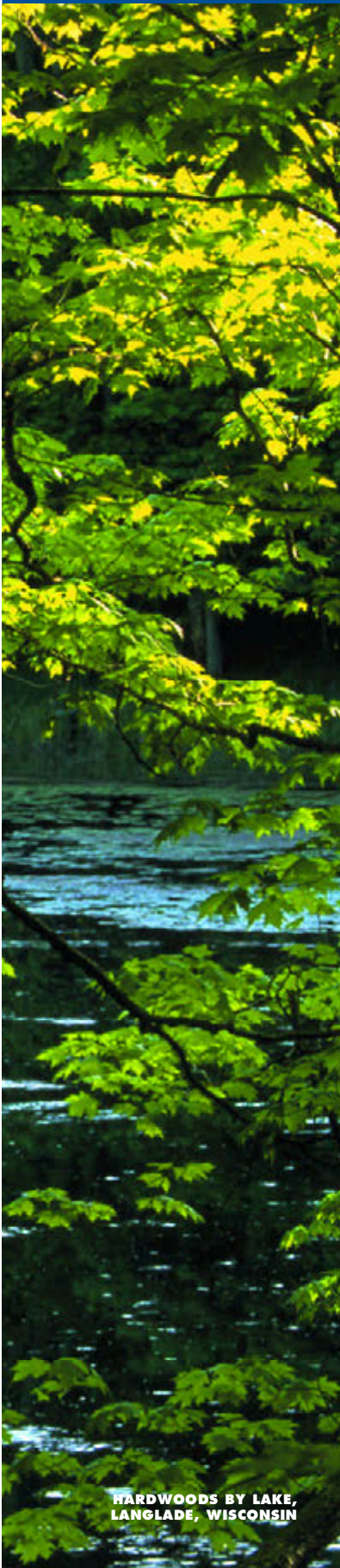
HARDWOODS BY LAKE, LANGLADE, WISCONSIN