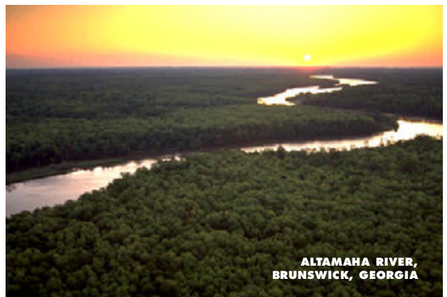
ALTAMAHA RIVER, BRUNSWICK, GEORGIA

Leaving stream and river banks as natural as possible — with the soil undisturbed and covered with trees, shrubs, wildflowers, mosses and ferns — helps prevent erosion. A stream bottom filled with pebbles — rather than a dirt-filled bottom — is one sign of a healthy stream.