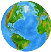
ABOUT 70% WATER

Water seems common, but you might be surprised to know just how uncommon it really is. As far as we know, Earth is the only planet in our solar system where water exists as a liquid. No living thing — plant or animal — can survive without it.